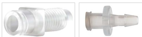
Figure 3: Left: Luer adaptor for direct mounting in the flow cell (e.g., IDEX P-624). Right: Barbed Luer adaptor for tube connection