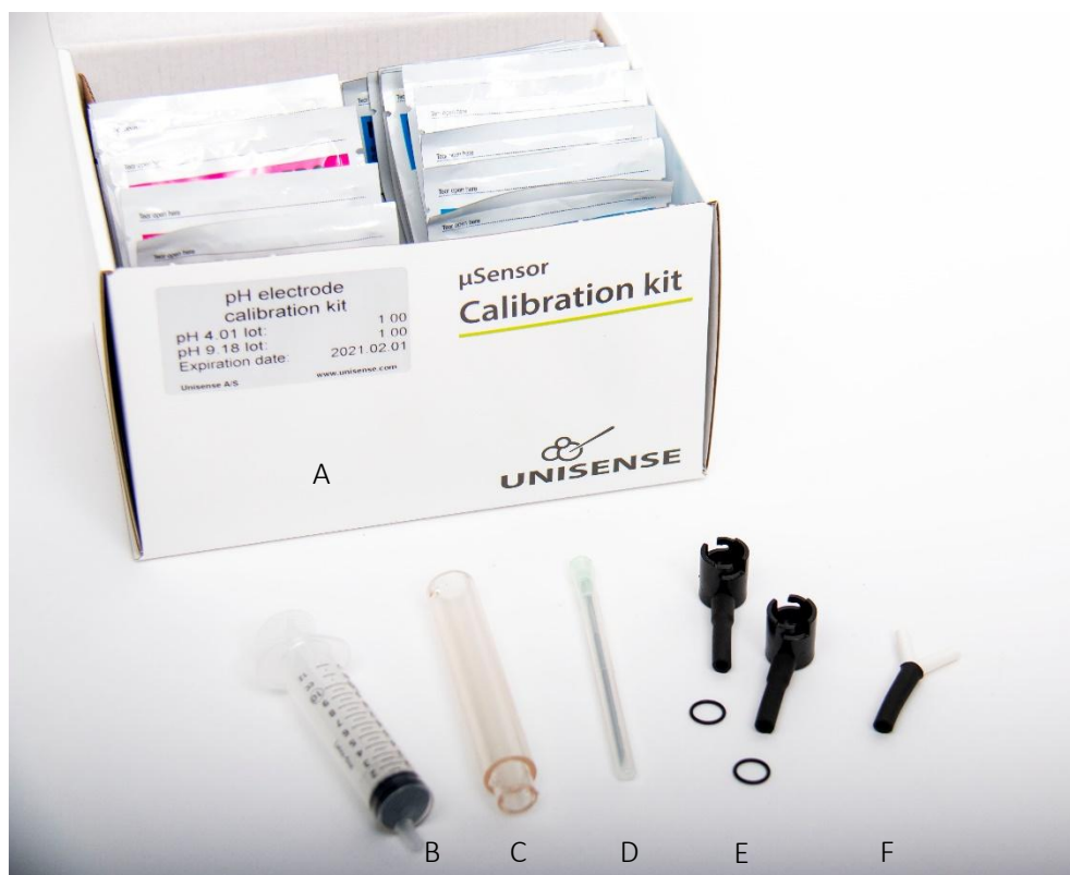
Figure 1: Calibration kit contents: A: Calibration kit box with pH buffer pouches, B: 10 ml syringe, C: 10 cm tube for reference electrode, D: 80 x 2.1 mm needle (green), E: two Calibration Caps with tubing and O-rings, F: Y-connector with tubing.