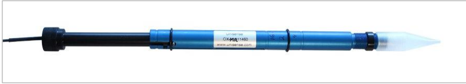
Figure 4: Oxygen sensor in the Microrespiration guide.

Sensors of the Microrespiration type (OX-MR) cannot be calibrated using the calibration cap. Instead, it is recommended to use the MR zero calibration chamber as described below.