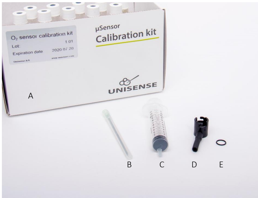
Figure 1: Calibration kit contents: A: Calibration kit box with Exetainers, B: 80 x 2.1 mm needle (green), C: 10 ml syringes, D: Calibration Cap with tubing, E: O-ring.