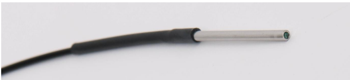
Figure 7: Optical oxygen sensor, Optode, in the Opto-3000 design.