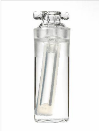
Figure 5: Zero calibration chamber (MR-Ch 0-calibration). The zero solution is outside the silicone tubing and pure water is inside. The oxygen in the water inside the tubing diffuses through the silicone tubing into the zero solution where it is consumed.

The water filled silicone tubing is now placed in the zero O 2 solution and O 2 from inside the silicone tubing will diffuse into the ascorbate solution and be consumed. It is recommended to leave the zero-calibration chamber over night for complete removal of O 2 from the water inside the silicone tubing.