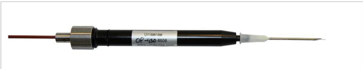
Figure 6: Optical oxygen sensor, Optode, in the Retractable Needle design.

NOTE: Before calibrating optodes, the optical fibre must be extended maximally out of the needle. This is done by pushing the inner steel cylinder into the black shaft.