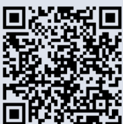
pH Microelectrode Manual