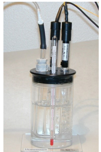
CAL300 with microsensors and bubbling with air.