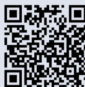
uSense Solutions Manual