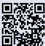
Full manual for all sensors