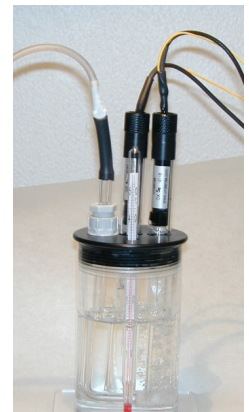
CAL300 with microsensors and bubbling with air.

A typical decrease in sensor signal over time for a sensor that has just been plugged in.