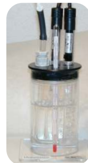
CAL300 with microensors and bubbling with air.