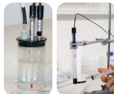
CAL300 with microensors and bubbling with air.