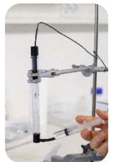
Injecting calibration liquid into protection tube using the calibration cap.