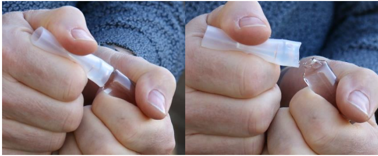
Figure 2: Open the ampoule. Leave the tubing on for protection.