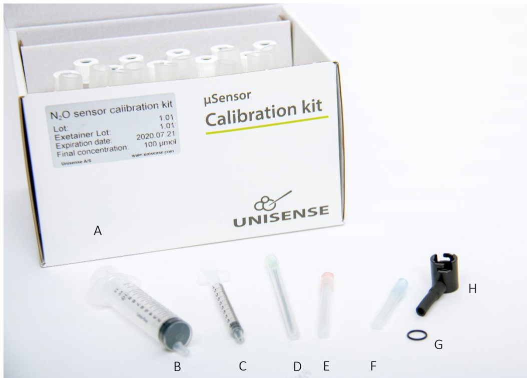
Figure 1: Calibration kit contents: A: Calibration kit box with Exetainers and ampoules, B: 10 ml syringe, C: 1 ml syringe, D: 80 x 2.1 mm needle (green), E: 50 x 1.2 mm needle (red), F: 30 x 0.6 mm needle (blue), G: O-ring, H: Calibration Cap with tubing.