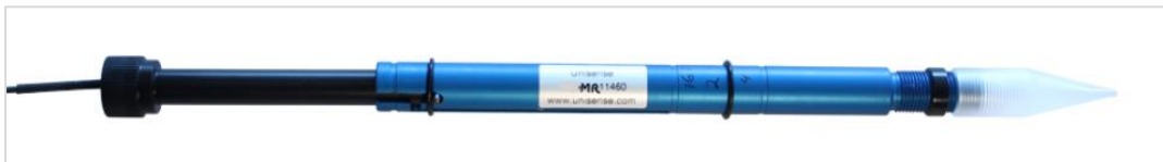
Figure 3: Microsensor mounted in the Microrespiration guide.