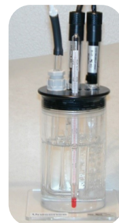
CAL300 with microsensors and bubbling with air.