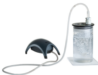
Calibration chamber CAL300