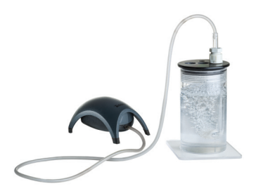
Calibration chamber CAL300

2. Add a defined volume of hydrogensaturated water to a defined volume of water in a calibration chamber. For instance, 1 ml of H<sub>2</sub> saturated water contains 0,805 μmol at 20 °C (see Table 1), and to obtain water with a hydrogen concentration of 10 μM, 3.08 ml hydrogen-saturated water should be added to a total volume of 246,9 ml hydrogen free water in the calibration chamber. After the addition of hydrogensaturated water to the calibration chamber mix it thoroughly by moving the sensor in its protection tube up and down for a few seconds and read the signal when it is stable. Do not stir bubbles into the water or mix by bubbling, as this will remove hydrogen from the water. A magnetic stirrer