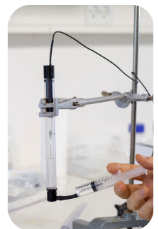
Injecting calibration liquid into protection tube using the calibration cap.