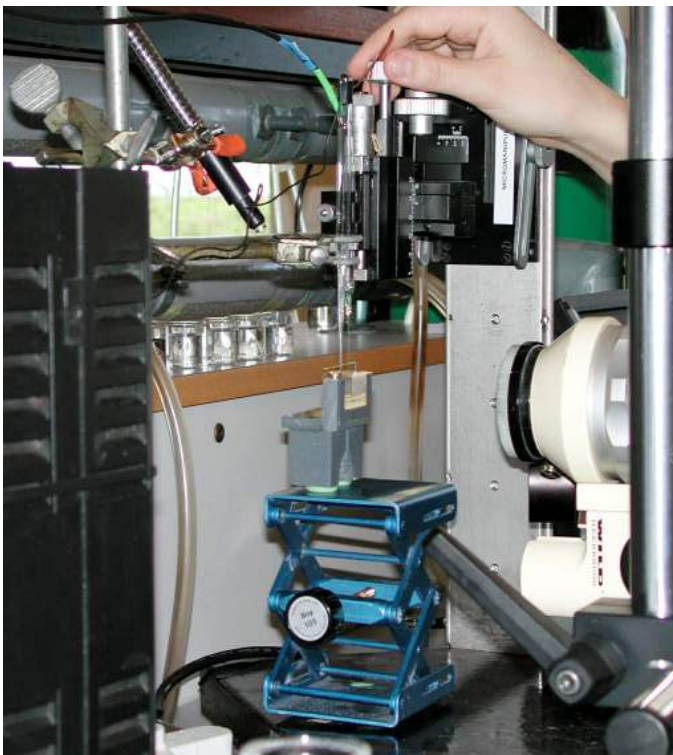
MicroProfiling setup with pH electrode and reference electrode

The microsensors were mounted on an MM33 and the position of the sensor tip was monitored using a stereo microscope.