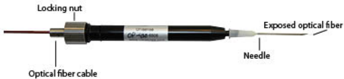
Adjustment of the fiber position.

Avoid bending of the cable as this might break the MicroOptode.