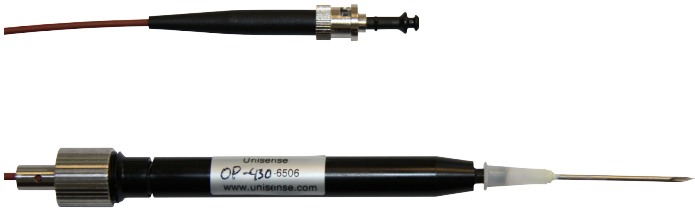
The MicroOptode and the connecting male fiber plug.

Remove the black cap from the MicroOptode connector and remove the red cap from the MicroOptode Meter. Insert the male fiber plug of the MicroOptode cable into the ST-receptacle of the MicroOptode Meter and turn the bayonet coupling gently clockwise until the plug is locked firmly.