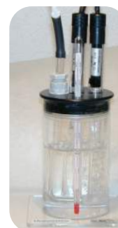
CAL300 with microensors and bubbling with air.