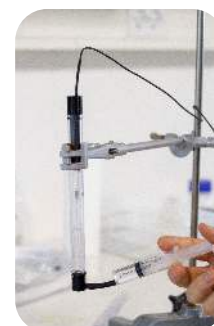
Injecting calibration liquid into protection tube using the calibration cap.