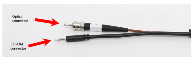
The MicroOptode cable with optical and E 2 Prom Connectors

Remove the cap from the Optode connector and the red cap from the Optode Meter. Insert the male fiber plug of the Optode cable into the ST-receptacle of the Optode Meter and turn the bayonet coupling gently clockwise until the plug is locked firmly. Insert the E2PROM connector on the sensor into the E 2 PROM connector on the Optode Meter.