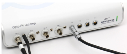
The MicroOptode and temperature sensor connected to the Opto-F4 UniAmp